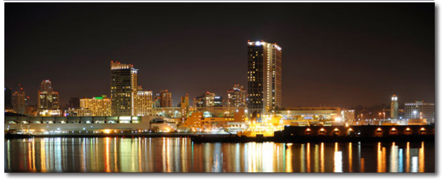
San Diego Skyline - from the Coronado Marriott Resort and Spa