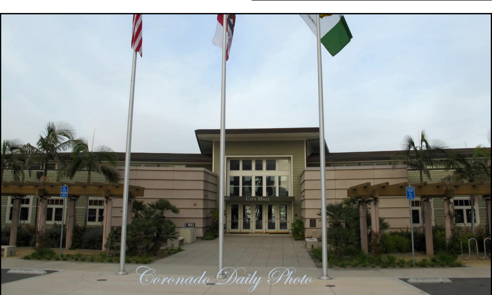
Coronado City Hall