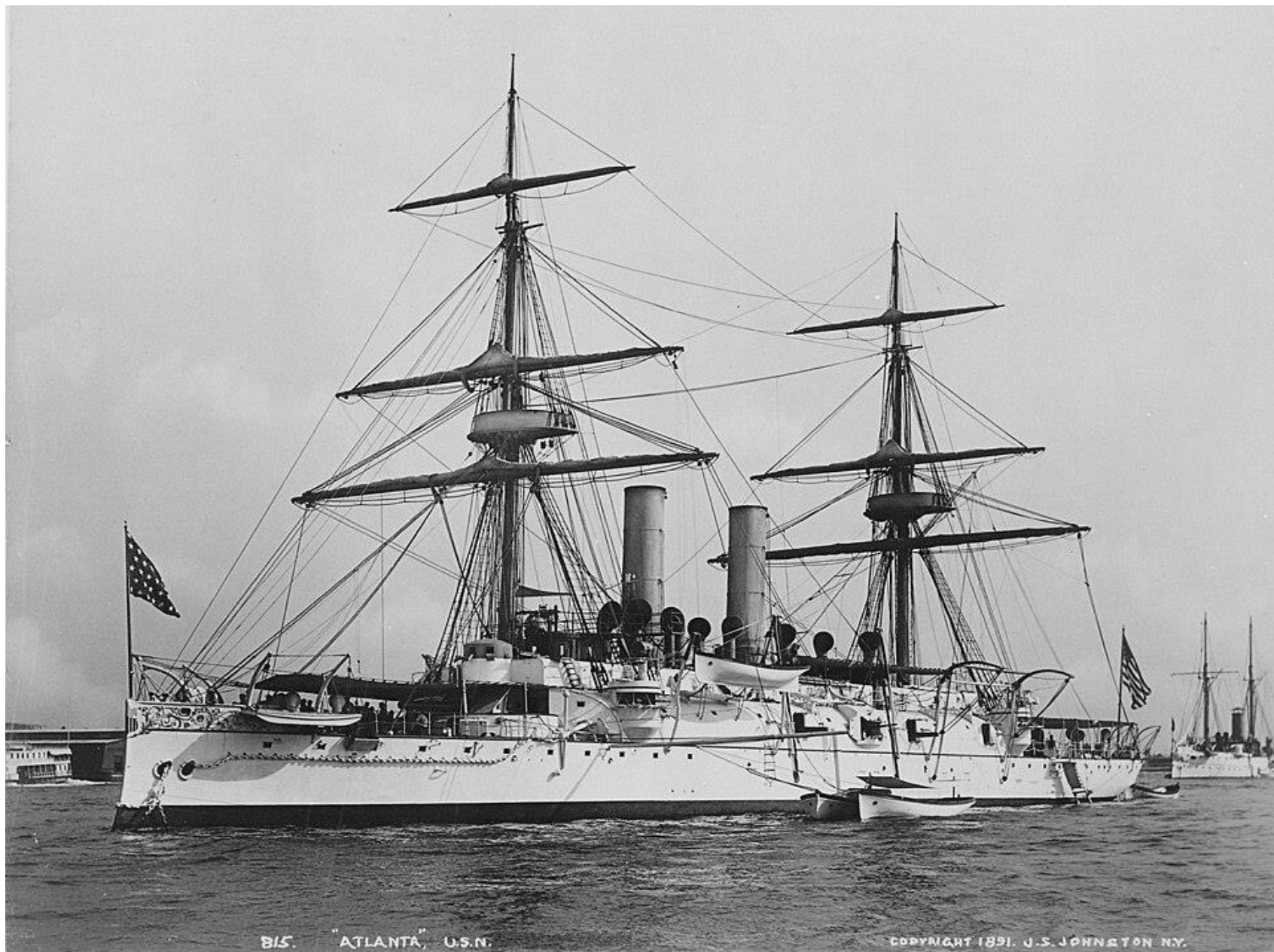
815. "ATLANTA," U.S.N.